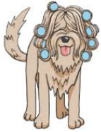
curl the fur