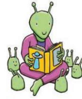
get near to hear